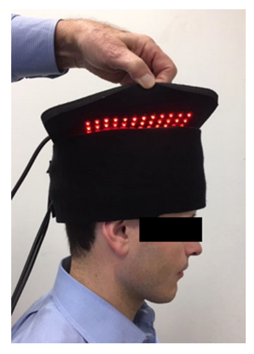
FIG. 1. Sequentially pulsed red/near-infrared device.

pad circled the skull and the other pad covered the top of the head, providing a total coverage area of 519 cm<sup>2</sup> with an average power density of 6.4 mW/cm<sup>2</sup>, an average energy density of 7.7 J/cm<sup>2</sup>, and a peak power density of 18.3 mW/cm<sup>2</sup> (Fig. 1). Published scientific evidence suggests that pulsed light is superior to continuous light application; therefore, red/